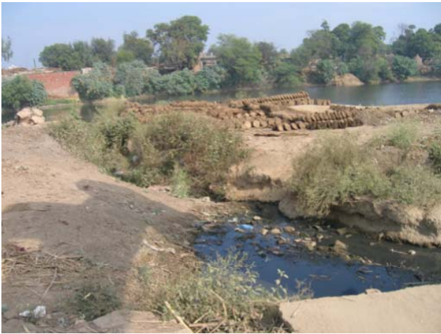
Sunder Nagar: Village pond before