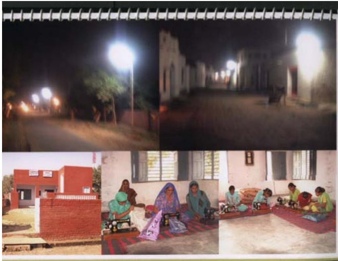
Mohabbatpur: Street lights and sewing school for ladies