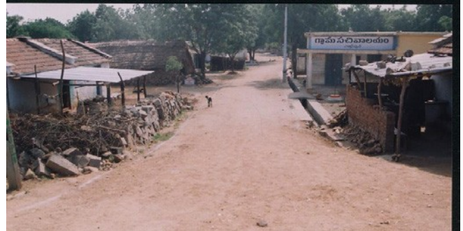
Eklaspur: Road repaired, drainage system to be finished