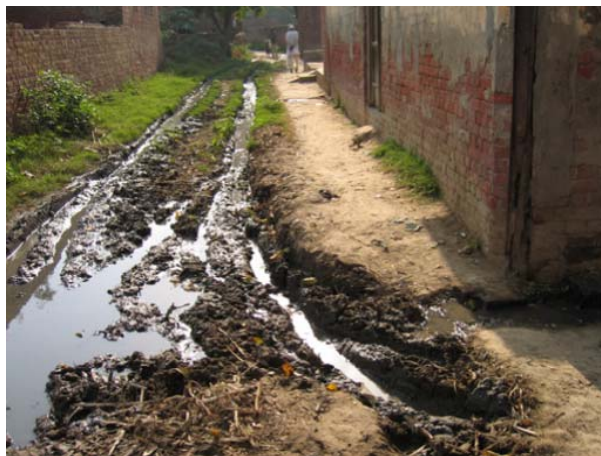
Sunder Nagar: Street before