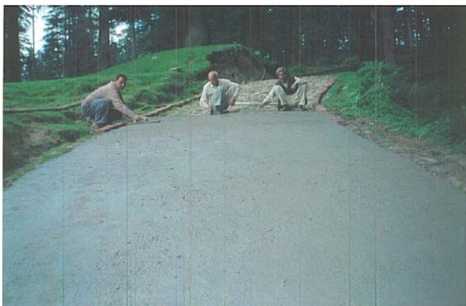
Khajjiar: Road to school being paved