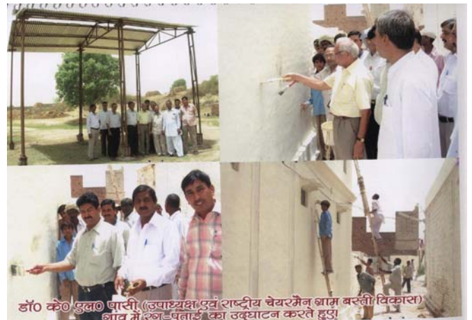
Mohabbatpur: Inauguration and other activities (4 different scenes)

MLA from that area has allocated Rs.10 lacs for development in the village