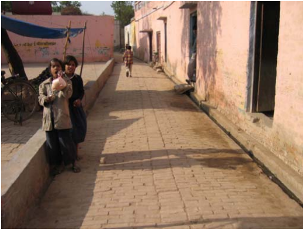
Sunder Nagar: Street after