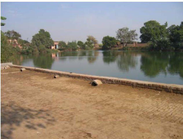
Sunder Nagar: Village pond after