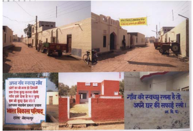
Mohabbatpur: Houses painted (4 different scenes)