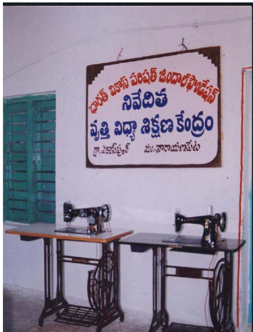
Eklaspur: Tailoring school