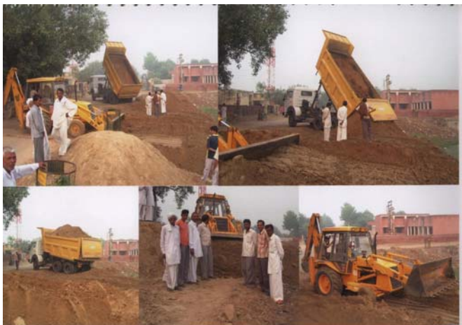
Mohabbatpur: Construction in progress (4 different scenes)