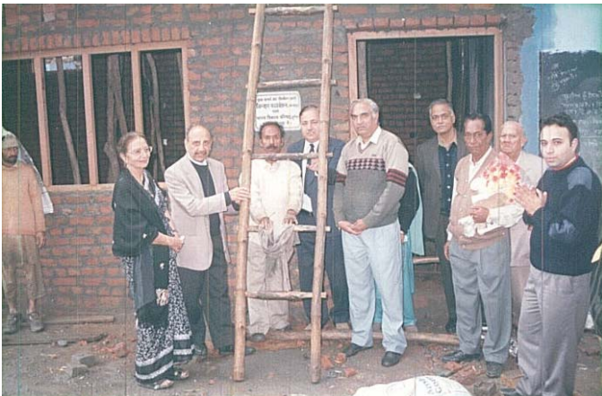
Room added to the school building - team of workers