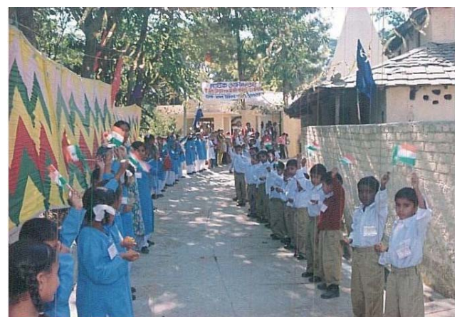
Dunera: Primary school students waiting for guests

Village with 4500 people, surrounded by 30 smaller villages. The following work has been 94% completed: