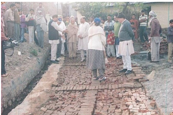
Dunera: Making base for road