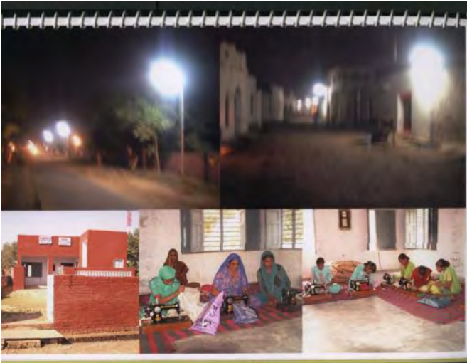
Mohabbatpur: Street lights and sewing school for ladies