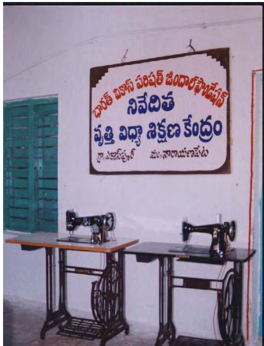
Eklaspur: Tailoring school