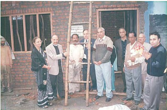
Room added to the school building - team of workers