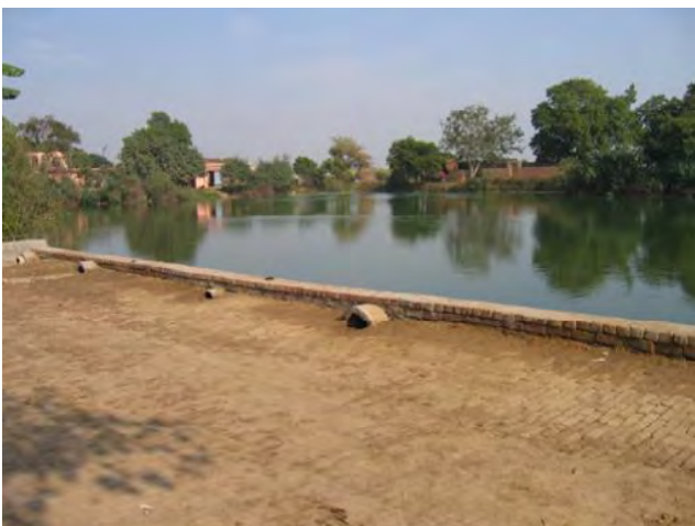
Sunder Nagar: Village pond after