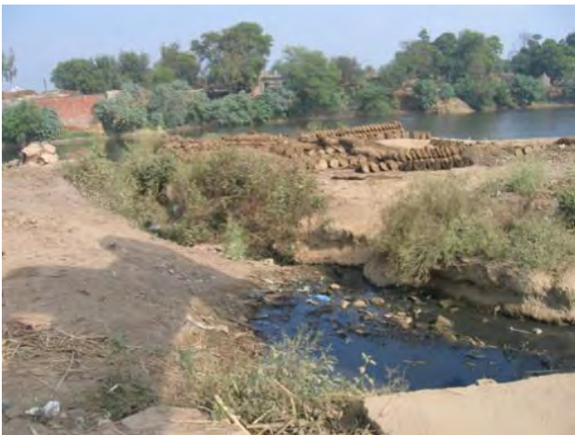
Sunder Nagar: Village pond before