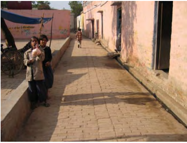
Sunder Nagar: Street after