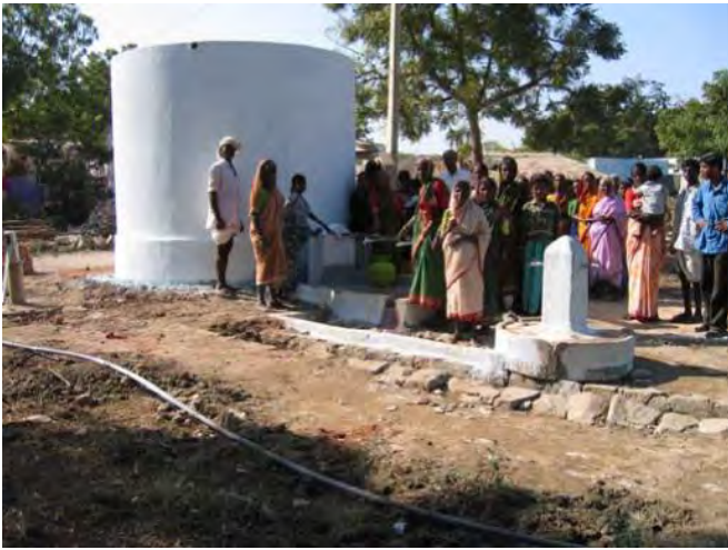
Eklaspur: Water tank