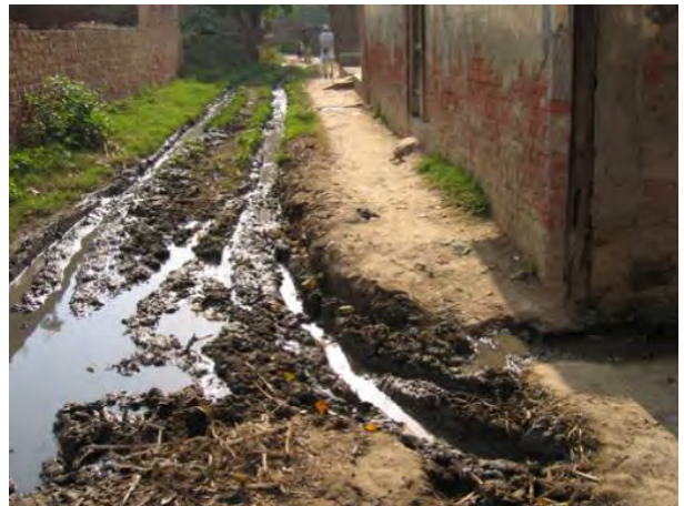
Sunder Nagar: Street before