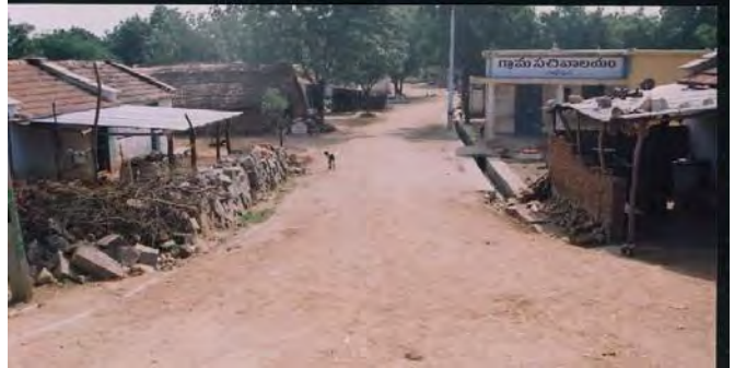
Eklaspur: Road repaired, drainage system to be finished