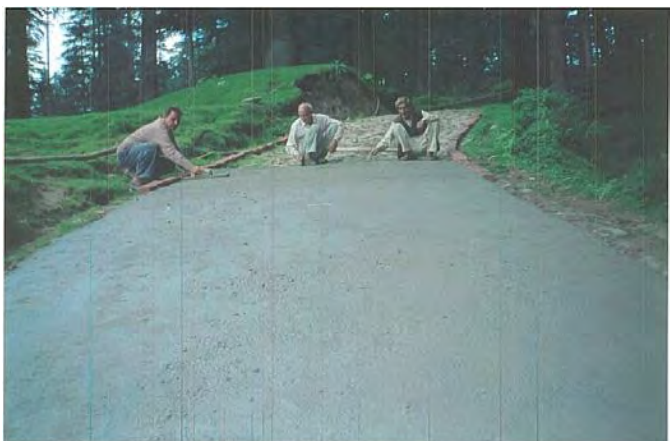
Khajjiar: Road to school being paved