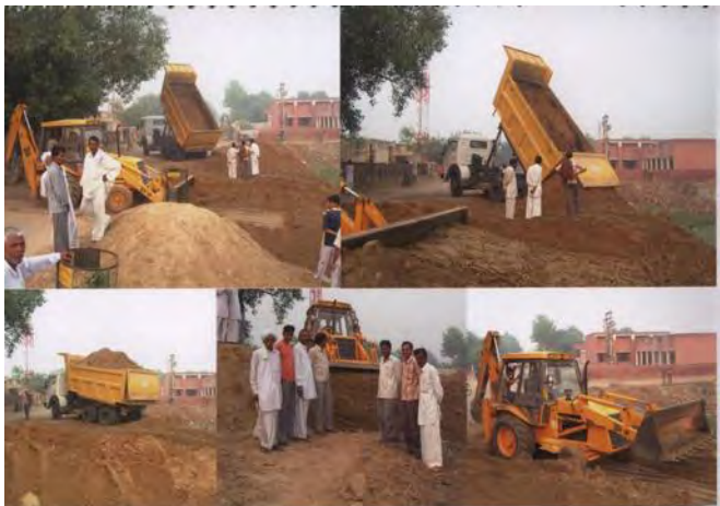
Mohabbatpur: Construction in progress (4 different scenes)