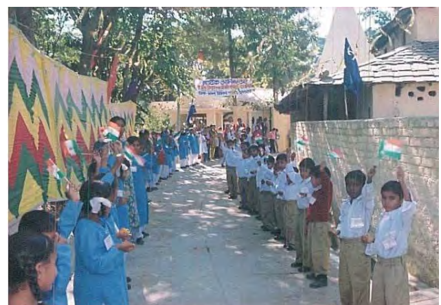
Dunera: Primary school students waiting for guests

Village with 4500 people, surrounded by 30 smaller villages. The following work has been 94% completed: