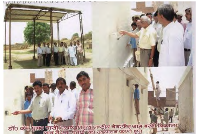
Mohabbatpur: Inauguration and other activities (4 different scenes)

MLA from that area has allocated Rs.10 lacs for development in the village