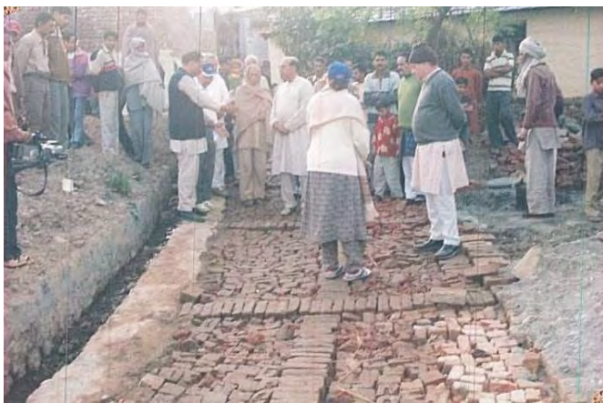
Dunera: Making base for road