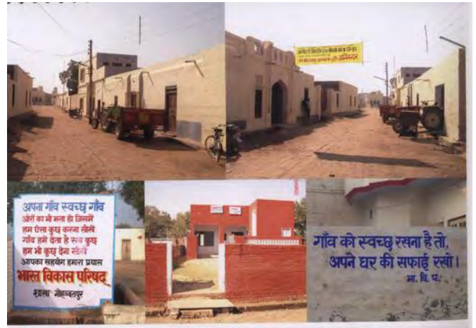
Mohabbatpur: Houses painted (4 different scenes)