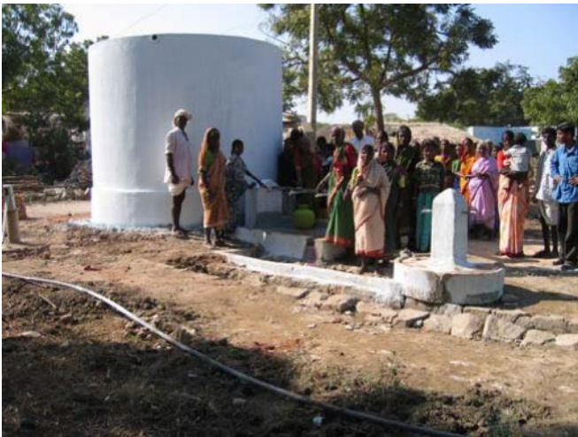
Eklaspur: Water tank