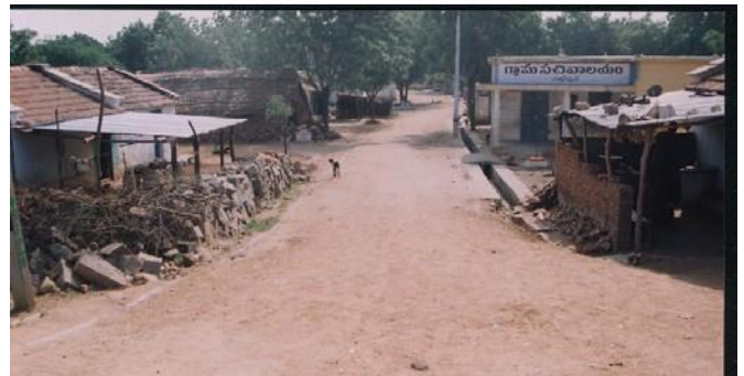
Eklaspur: Road repaired, drainage system to be finished