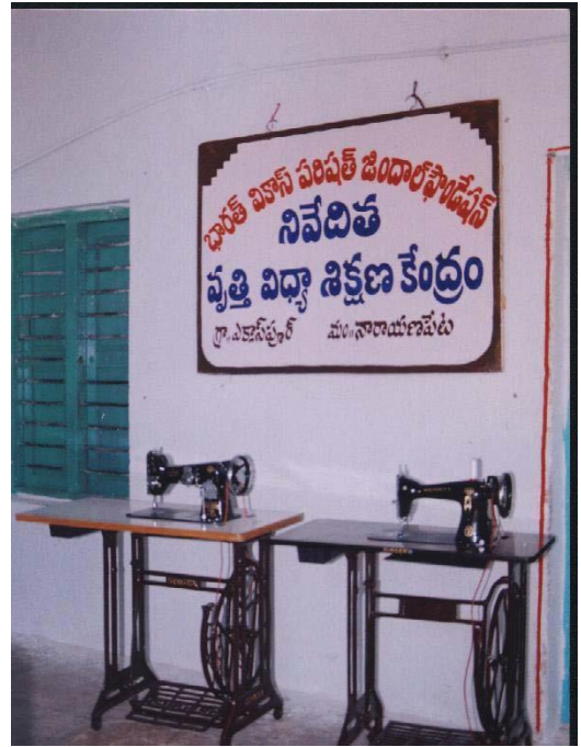
Eklaspur: Tailoring school